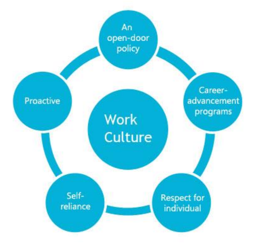
Figure 2: Work culture impacting employee well-being

In the study, it was revealed that companies are an employee centric company and to measure the team performance target, employee satisfaction index and the number of new employees acquired sums up the criteria for to measure the team performance targets. They use employee satisfaction index, retention rate and percentage of new employees acquired to set team performance targets and the team and individuals are measured against those set targets, The company evaluates the set targets at a quarterly level to make sure the team performance is on track and this timely check on performance metrics helps the team and individuals to modify their strategy in case it is required to achieve the annual targets.