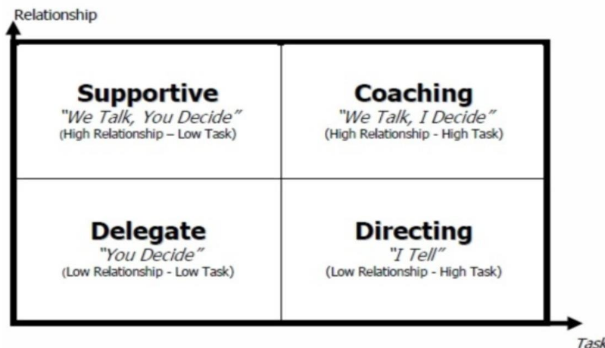
Figure 4 illustrates situational leadership at Hormuud Telecom has the potential to contribute to the development of an organisational culture that is more dynamic and responsive. This culture would make it possible for leaders to assist their team members in accomplishing their objectives while simultaneously propelling the firm towards success by supporting, coaching, delegating and directing them for the realization of Telecom's vision and goals.

Adopting situational leadership concepts at Hormuud Telecom may optimise communication, promote employee engagement, and ultimately bolster organisational performance. This approach acknowledges the absence of a universally applicable leadership style and emphasises the need of leaders to adapt their behaviour to accommodate the requirements of their team members and the circumstances they face.