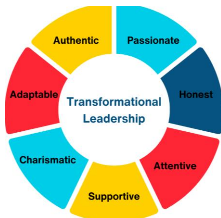
Figure 1: Transformational leadership at Hormuud Telecom, Somalia characterised by traits such as charm, enthusiasm, openness, sincerity, honesty, and flexibility. This allows for creativity and innovation to thrive within the organization, leading to better problem-solving and decision-making. Similarly, these attributes assist leaders in motivating employees to accept risks and think outside the box by encouraging their team members to do the same and be open to new ideas and innovations.