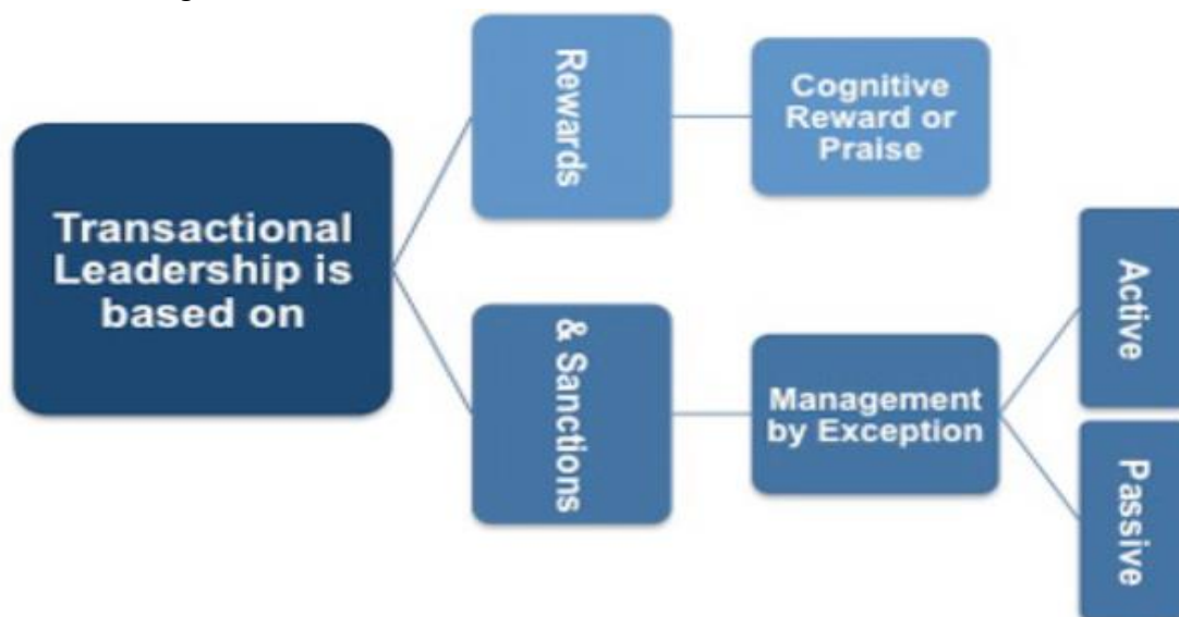
Figure 2 depicts that the notion is derived from 'quid pro quo,' which translates as 'anything for something.' In this leadership style, the leader establishes unambiguous expectations and objectives for the team and provides incentives or penalties